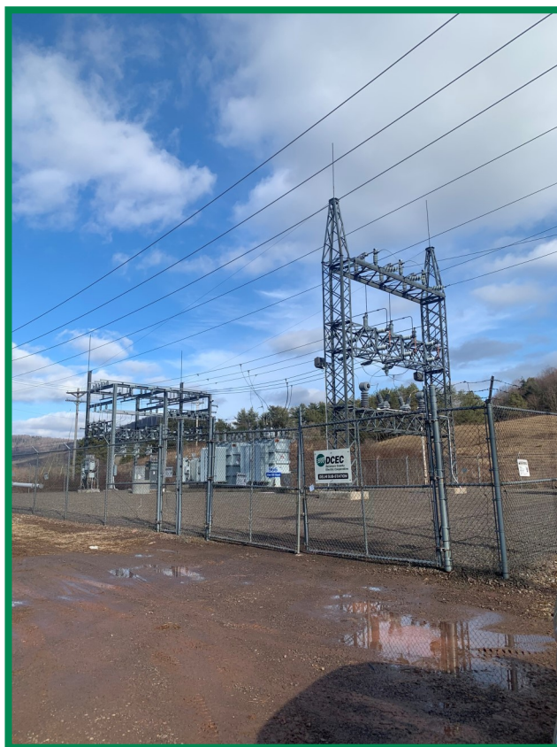
DCEC Delhi Substation