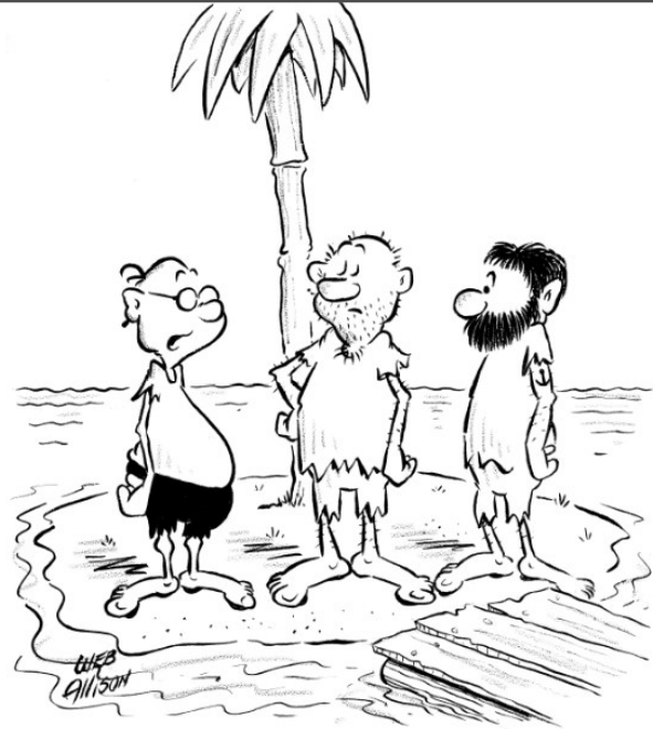
"Personally, I think the first thing we should do is organize a rural electric cooperative."

Please do not approach crews working in the field at this time we are striving to make as little contact with our members as possible. Please give out field staff a wide berth for their safety and yours.