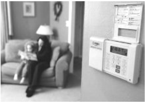
A Smart Grid In-Home-Display

DCEC is proceeding with a system-wide deployment of Smart Grid technology. The program, funded through grants and from the U.S. Department of Energy and the New York State Energy Research &