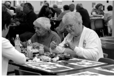
DCEC members enjoying their chicken BBQ at the 2009 Annual Meeting

The Delaware County Electric Cooperative will hold its Annual Meeting on Friday, September 10th at the Delaware Academy & Central School in Delhi. As always, the meeting gives members a chance to gather for a barbecue chicken dinner, hear reports on the activities of the co-op over the past year and learn about plans for the future. Members will also vote on matters of DCEC business including the election of three members of the board of directors (see page 2 for more details).