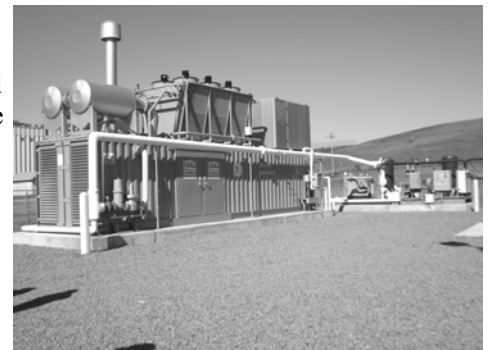
DCEC's Waste-to-Energy Project

DCEC will be holding an “Open House” at the facility on Saturday, July 11 th from 10am to 1pm in conjunction with the Delaware County Solid Waste Facility (& Composting Facility) Open House that same day. Come to see us and take a tour of the project!