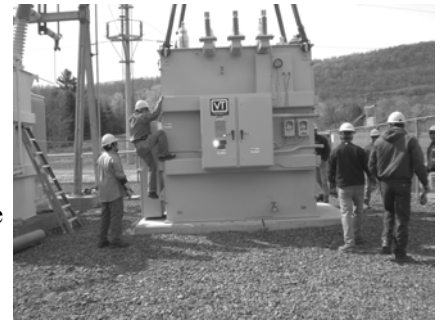
New Kortright transformer

On April 29, 2009 DCEC took possession of a new transformer planned for our South Kortright substation. Our crews have been working in preparation for the final connection of this unit for late summer. During the connection process there will be a needed outage that will be a duration of a few hours. Members in the Kortright, Stamford, Bovina, Davenport, Meredith, Harpersfield and Jefferson areas will be affected and notified in advance of the outage time and duration. This unit should give decades of quality service and we appreciate the members understanding and cooperation.