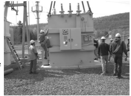
New Kortright transformer

On April 29, 2009 DCEC took possession of a new transformer planned for our South Kortright substation. Our crews have been working in preparation for the final connection of this unit for late summer. During the connection process there will be a needed outage that will be a duration of a few hours. Members in the Kortright, Stamford, Bovina, Davenport, Meredith, Harpersfield and Jefferson areas will be affected and notified in advance of the outage time and duration. This unit should give decades of quality service and we appreciate the members understanding and cooperation.