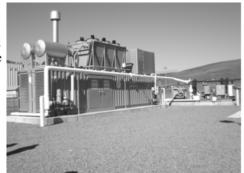
DCEC's Waste-to-Energy Project

DCEC will be holding an “Open House” at the facility on Saturday, July 11 th from 10am to 1pm in conjunction with the Delaware County Solid Waste Facility (& Composting Facility) Open House that same day. Come to see us and take a tour of the project!