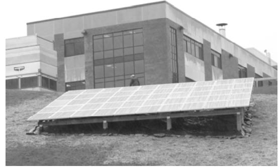
12 kW Solar/PV project at DCMO BOCES in Masonville

Construction has been completed on a solar photovoltaic (PV) project rated at 12 kW at the DCMO BOCES Western Delaware campus located near Trout Creek, NY. The project was successfully interconnected with the DCEC system on November 10, 2011. This PV system consists of 50 PV panels and associated inverters and it is expected to produce approximately 13,500 kWh annually. Partial funding assistance for the construction of this project was provided by DCEC through an agreement with the New York Power Authority (NYPA). The BOCES project is the thirteenth and final project receiving funding assistance from DCEC under the agreement with NYPA.