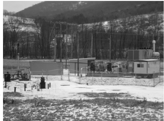
Completed Delaware County Waste-to-Energy Project

We are very pleased to finally see power being produced at the facility. This will help us stabilize rates to our members and provide benefits to Delaware County taxpayers as well. In early 2008, DCEC and Delaware County entered into an agreement giving DCEC rights to the gas produced at the landfill, and rights to develop the project at a site location adjacent to the DPW Composting Facility.