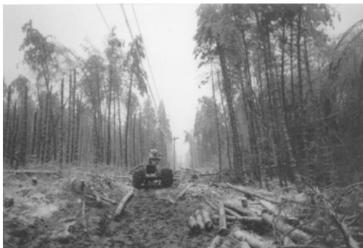
DCEC crews clearing downed trees from ice storm

Members experienced the second major outage of the season on December 11 th – 15 th , 2008. The hardest hit areas were members in Jefferson, Gilboa, and Harpersfield. Others affected included the Towns of Kortright, Davenport, Meredith, Delhi, and Hamden. The culprit was a severe ice storm, the same storm that hit other counties within New York and surrounding states.