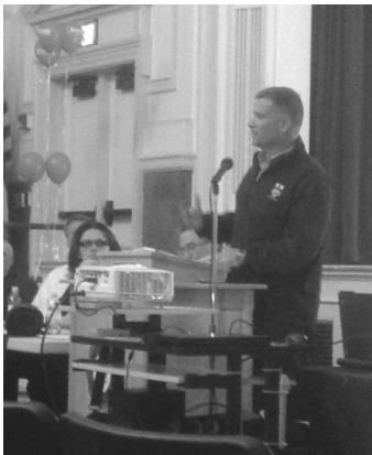
Congressman Chris Gibson addressing DCEC members at the 2013 Annual Meeting

Members gathered on Friday, September 20 for DCEC's 69th Annual Meeting at the Delaware Academy & Central School in Delhi. A total of 218 people attended including 123 voting members.