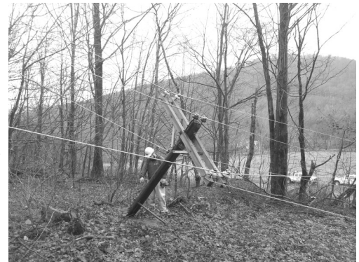
DCEC Lineman, Steve Little, stands next to a broken pole near the Andes substation.

Numerous trees had fallen creating broken wires, three broken poles and damage to a limited number of homes. Overall we were much more fortunate than our fellow utilities downstate.