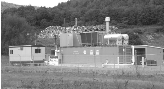
Delaware County Waste-to-Energy Project

DCEC's Waste-to-Energy Project is being shut down because the expenses of operating the plant exceed the benefits to our members. The plant's revenues were limited by smaller than expected gas supply from the landfill in combination with lower than expected energy prices. Currently DCEC is marketing the plant assets including the engine/generator in order to recover as much of our initial investment as possible. The Waste-to-Energy project is presently on DCEC's balance sheet with a value of $1.91 million based on the initial cost to construct it. DCEC will probably recover approximately $250,000 by liquidating the assets of the plant. The net cost to DCEC, which will be spread out over approximately 10 years, will be approximately $1.66 million. Carrying this expense has made the rates paid by members approximately 2% higher than they would have been in the absence of the Waste-to-Energy project.